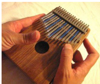
The thumb piano has many names: mbira, finger piano, gourd piano.