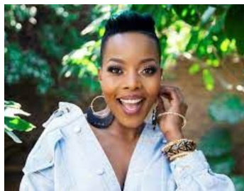
Nomcebo Zikode sings on the song Jerusalema.