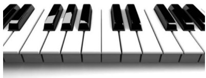
Instruments for Blues music